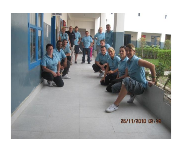
British Gas Engineers