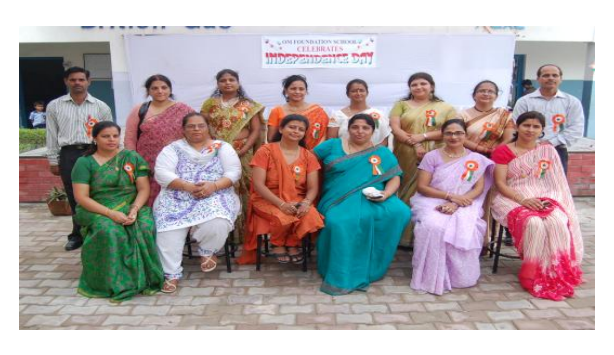
The school has got 20 regular staff which includes 15 qualified teachers and a Head-mistress.