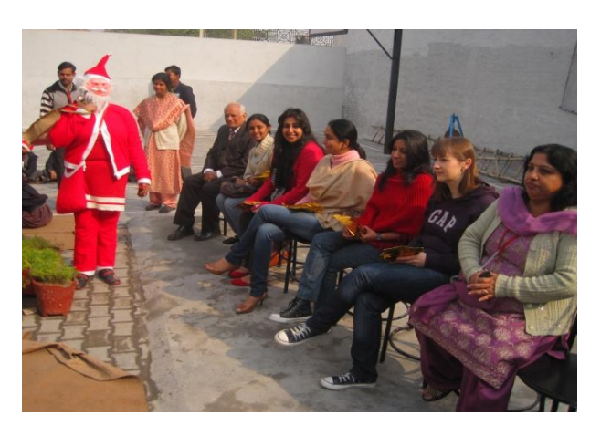
EXL and Centrica India Volunteers