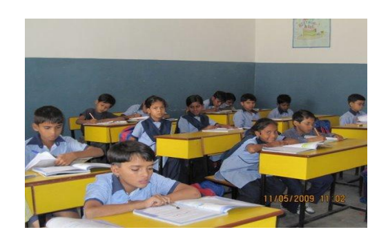
The uniforms, books and stationery are free to all the students.