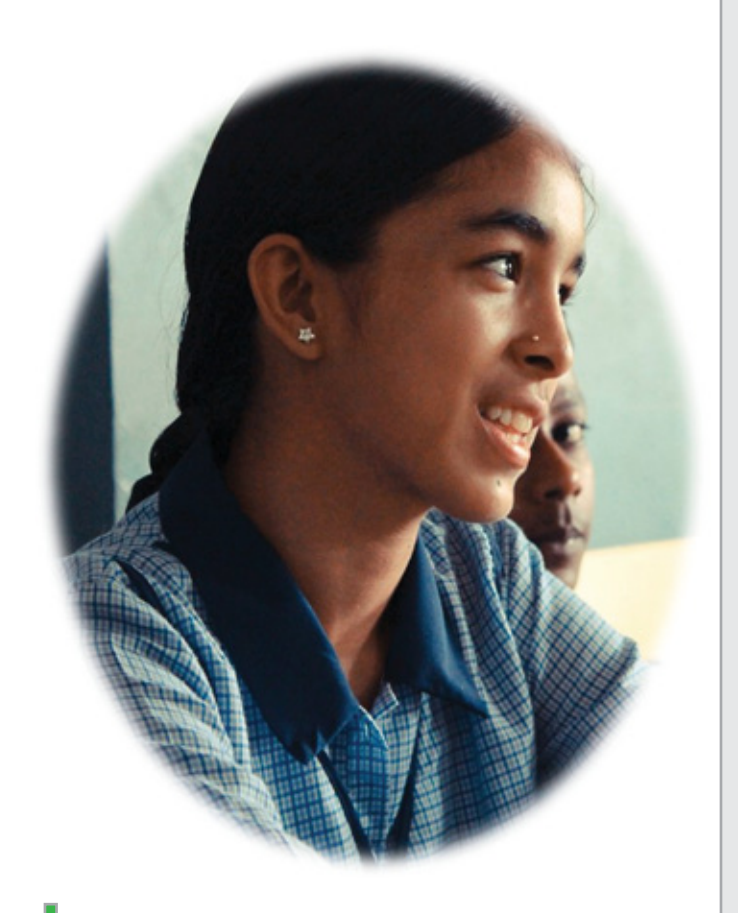
Confident, Courageous and Courteous.