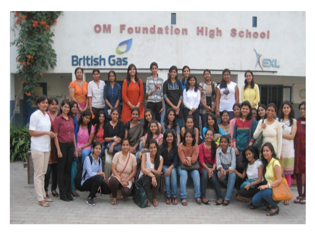
Women Business Leader Of Tomorrow Visit OFS