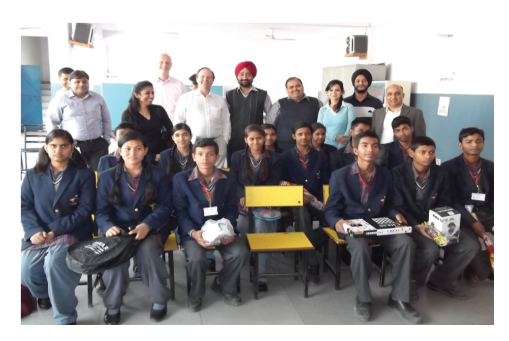
BG Leadership Visit

We are humbled by the visits of the eminent personalities of the corporate world and this always motivates the entire team of OM Foundation. We thank them from bottom of our heart.