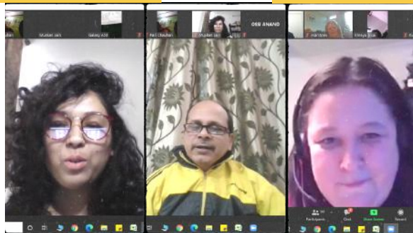
CHRISTMAS CELEBRATIONS WITH EXL SERVICE