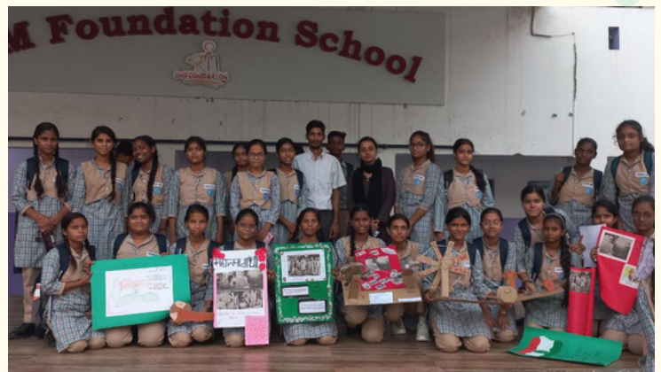
Celebrations of Afternoon School students