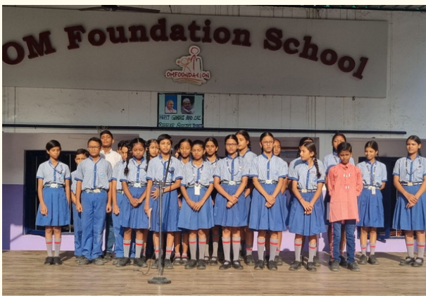
Celebrations of Day School students

An inter-house art competition was also held where students enthusiastically participated in Slogan writing, Portrait making, and Folder making activities. The celebrations instilled in students the values of truth, non-violence, simplicity, and patriotism along with boosting their creativity.